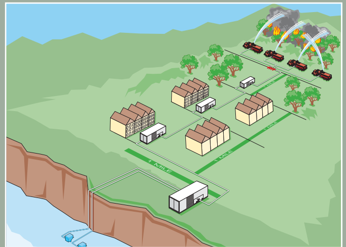
Series or Relay Operation