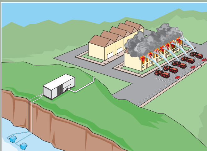
Pumping to Multiple Devices and Apparatus