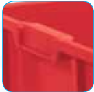
Large comfort grip handles for easy lifting