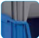
Side ribs add reinforcement for stacking stability