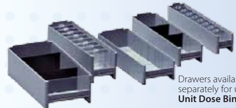
Drawers available separately for use as Unit Dose Bins