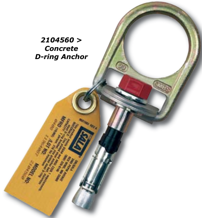
2104560 > Concrete D-ring Anchor

Anchorage Requirements Select a location on a suitable strength anchorage surface that will provide overall safety and proper loading. The concrete must have a minimum compression strength of 3000 psi (2,685 kPa). The concrete base material must be at least 6-1/4 inches (16mm) thick and the mounting hole must be located at least 15 inches (38mm) from any free edge. When mounting more than one anchor, they must be separated by at least 10 inches (25.4mm).