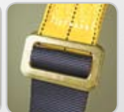
Tongue Buckle Pass-Thru Buckle