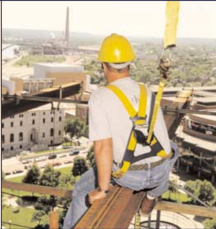
8 ft. Model 3101001

Easy Installation Simply attach to a safe anchorage point above the desired work area by attaching a carabiner to the swiveling anchorage loop and to your anchorage point. Then hook-up the lifeline to the back D-ring of your Delta No-Tangle™ harness and you're ready to go.