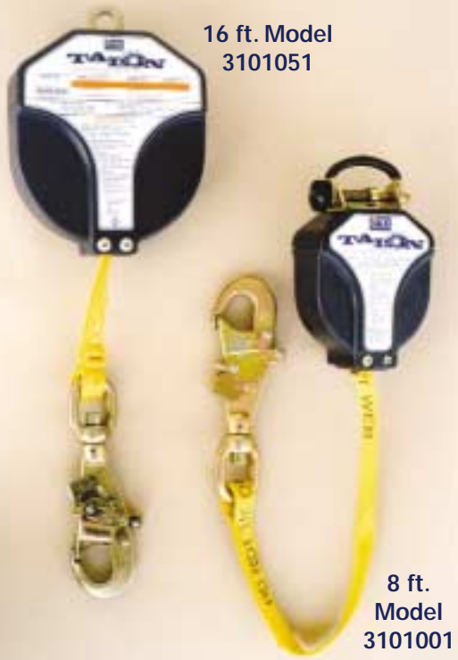
16 ft. Model 3101051