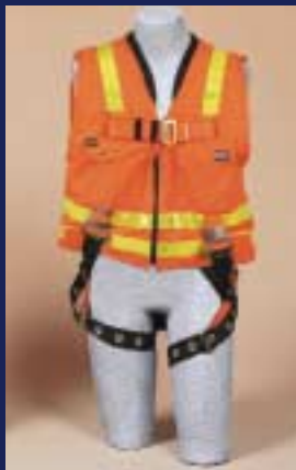
Delta No-Tangle™ WorkVest Harness (1107404)