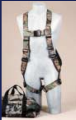
Advantage® Camo Delta No-Tangle™ Harness (1107900)