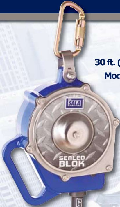
30 ft. (9m) Model