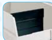
Removable divider for increased storage flexibility