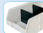
Curved-bottom hopper front for easy content access