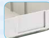
Large front label area for content identification