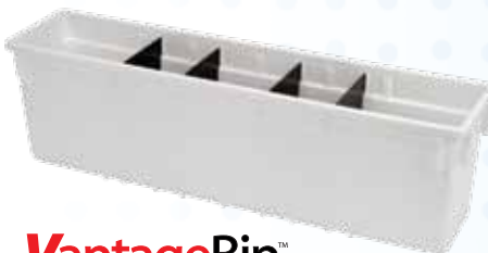
VantageBin™ By Akro-Mils