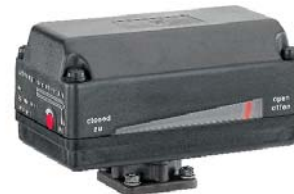
Actuator size 1