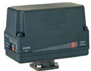
Actuator size 2