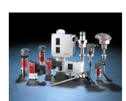
Sensors and Transmitters