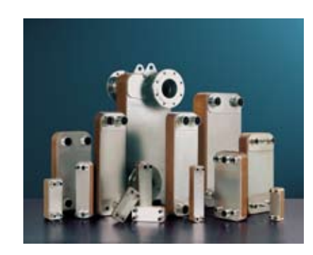
Brazed Plate Heat Exchangers