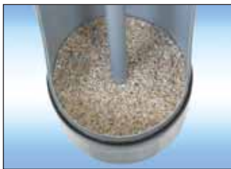
Standard Mineral Tank

Standard tanks use gravel under bedding, which adds weight and cost. Also, re-bedding is more difficult, should riser tubes pull out of the gravel bed.