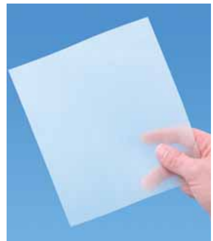
PP Mesh Media