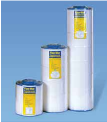
Standard Synthetic Media

With cellulose-free synthetic and mesh media in a wide range of micron ratings.