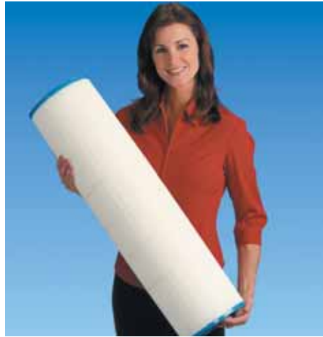
Flow-Max jumbo filter cartridge