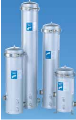
4 & 5 Round Models

Stainless steel filter housings with easy, safe and secure band-clamp lid closure.