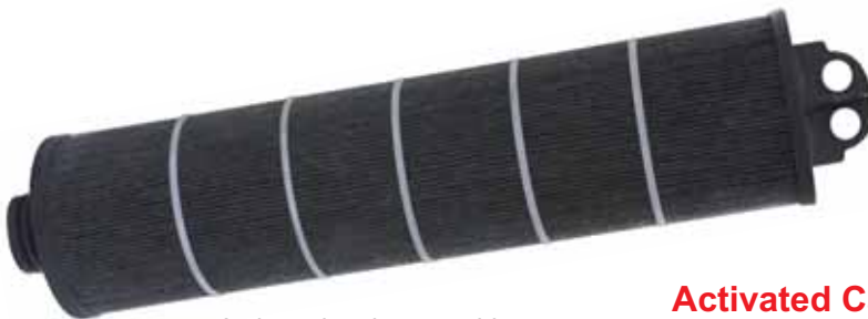
Activated carbon cartridge