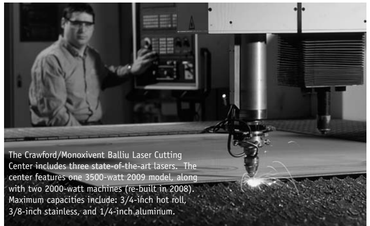
The Crawford/Monoxivent Balliu Laser Cutting Center includes three state-of-the-art lasers. The center features one 3500-watt 2009 model, along with two 2000-watt machines (re-built in 2008). Maximum capacities include: 3/4-inch hot roll, 3/8-inch stainless, and 1/4-inch aluminum.