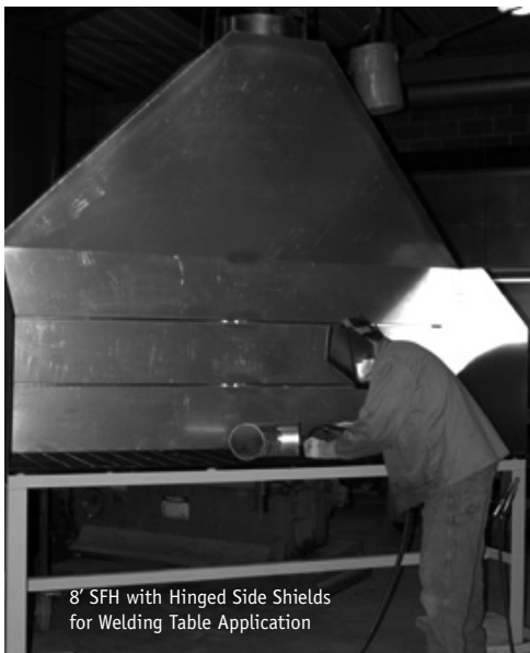
8' SFH with Hinged Side Shields for Welding Table Application