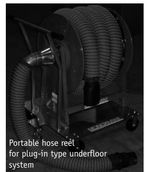
Portable hose reel for plug-in type underfloor system