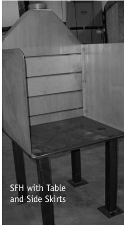
SFH with Table and Side Skirts

Slotted Fume Hoods are available in a vast array of sizes with numerous accessories. Side skirts are a common addition. The hood may also be connected to a welding table. A stainless steel construction is an option. Also, larger sizes are an option.