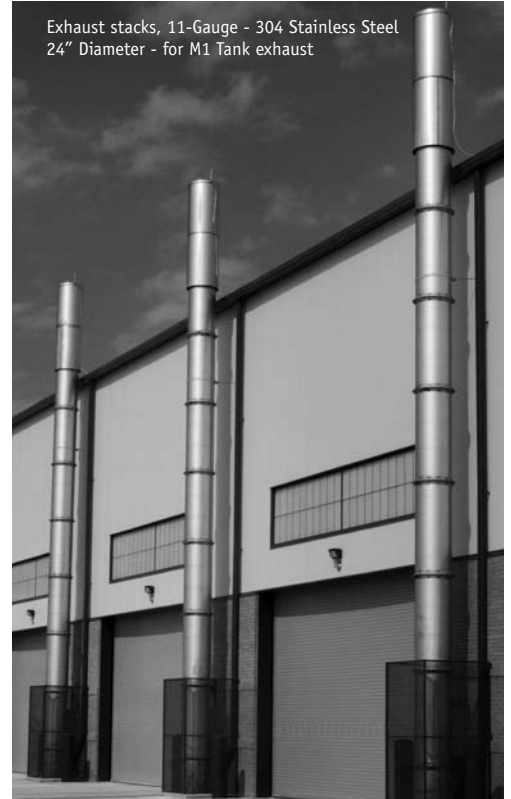
Exhaust stacks, 11-Gauge - 304 Stainless Steel 24" Diameter - for M1 Tank exhaust