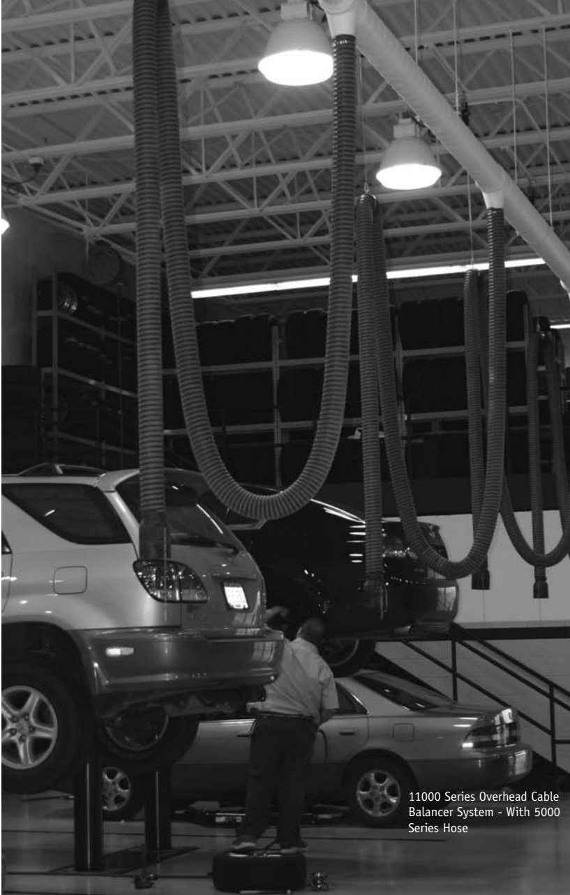
11000 Series Overhead Cable Balancer System - With 5000 Series Hose