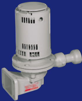
LOW NPSH PUMPS