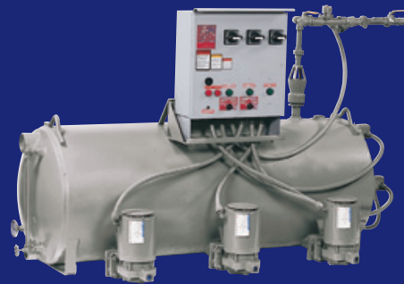
BOILER FEED UNITS