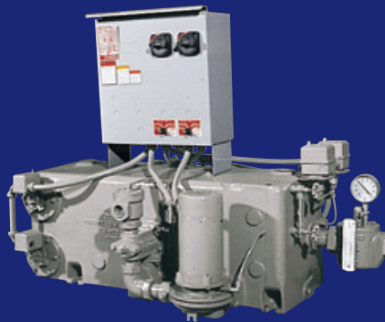
VACUUM HEATING UNITS