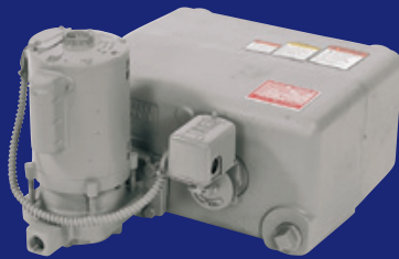
CONDENSATE RETURN UNITS