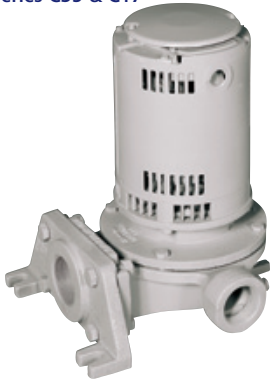
Series C35 & C17