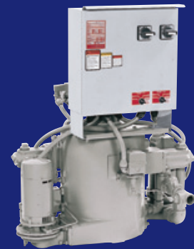
INDUSTRIAL VACUUM UNITS