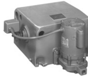
Condensate Transfer Units

Designs and manufactures an extensive line of heat exchangers for HVAC and industrial applications. Products include U-Tube, Straight Tube (with fixed or floating tube sheet), Brazed Plate and Gasketed Plate Heat Exchangers.