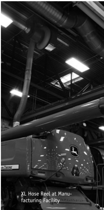
XL Hose Reel at Manufacturing Facility