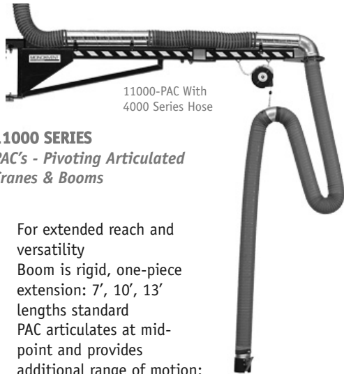
11000-PAC With 4000 Series Hose