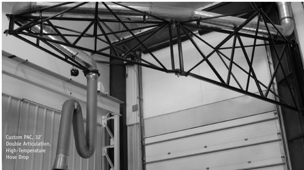
Custom PAC, 32' Double Articulation, High-Temperature Hose Drop