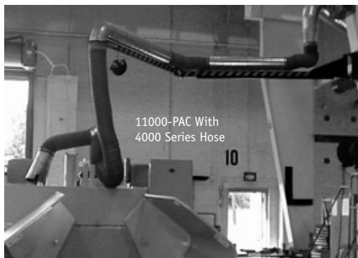
11000-PAC With 4000 Series Hose