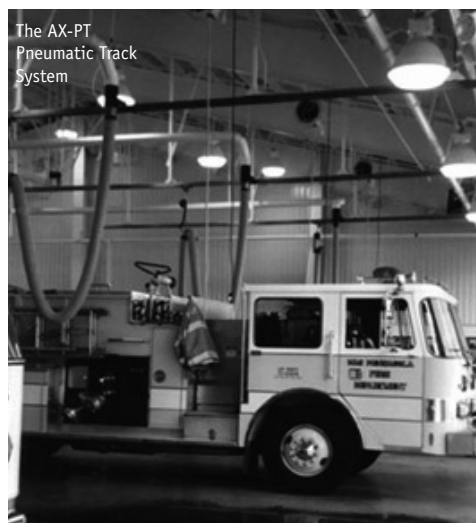
The AX-PT Pneumatic Track System