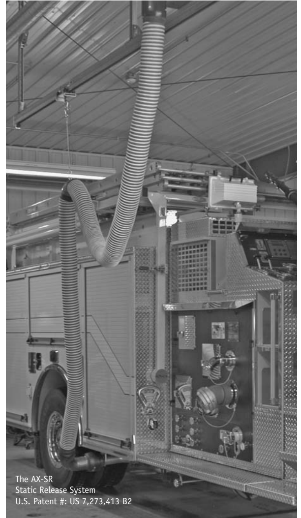
The AX-SR Static Release System U.S. Patent #: US 7,273,413 B2