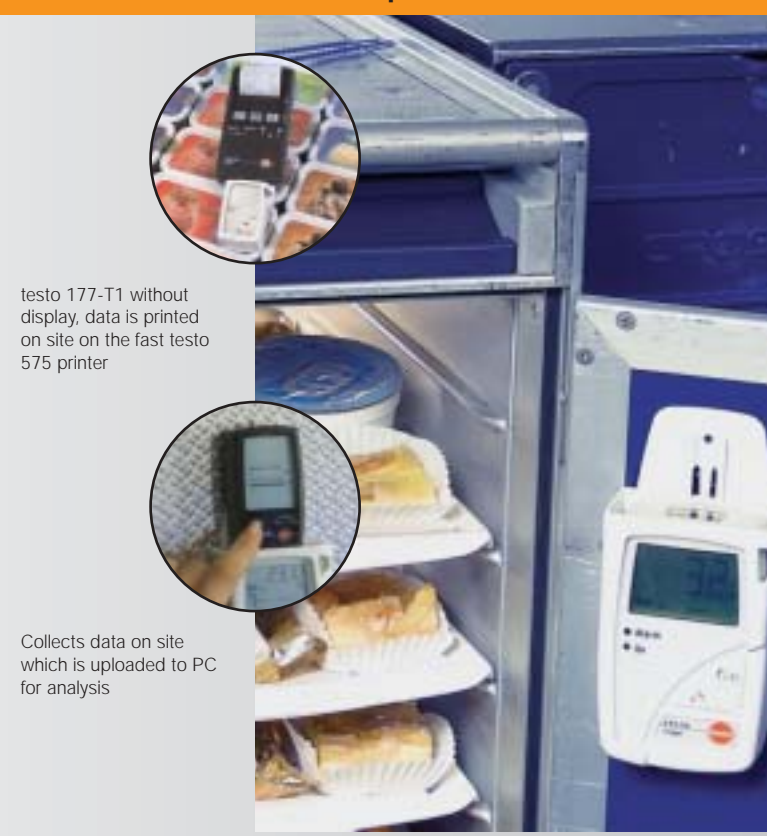
Long-term temperature logging with immediate display when limits are exceeded e.g. during transport, in refrigerated rooms, warehouses etc.

All of the values collected by the testo 580 data collector during long-term monitoring over months/years can be sent to your notebook/PC. Convenient analysis possible using software based on Windows®.