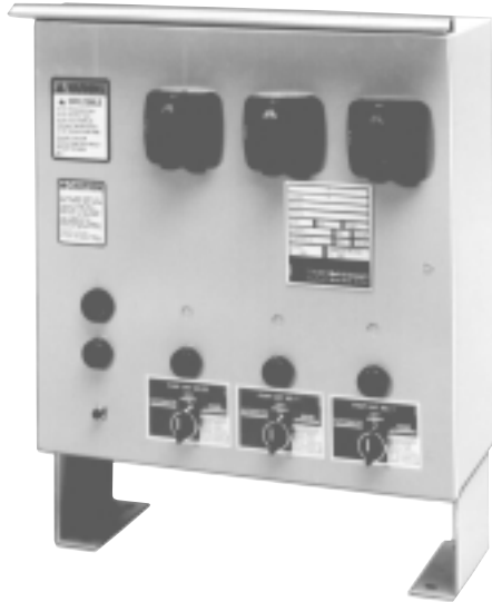
NEMA 2/U.L. LISTED CONTROL PANEL

Domestic® and Hoffman® Consolitol® Control Cabinets are available to comply with NEMA and JIC specifications. Panels may be factory mounted and wired or furnished for wall mounting.