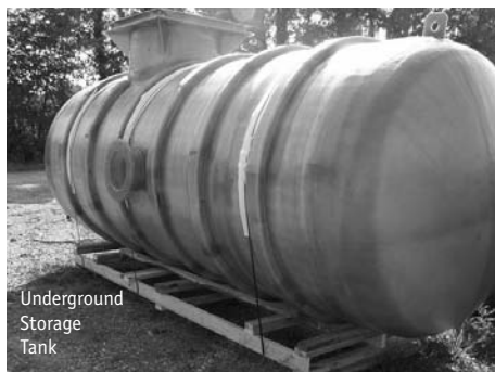
Underground Storage Tank

Monoxivent's design team offers engineering and layout support for custom solutions. This coupled with a manufacturing sources featuring over 40 years of experience, a 70,000-sq. foot facility, and state of the art equipment makes Corrosion Composites an excellent source for FRP products.