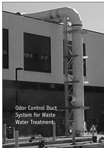
Odor Control Duct System for Waste Water Treatment