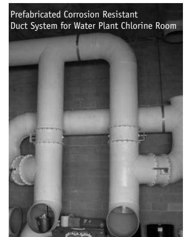
Prefabricated Corrosion Resistant Duct System for Water Plant Chlorine Room