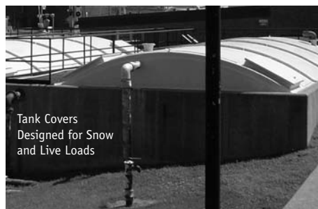
Tank Covers Designed for Snow and Live Loads