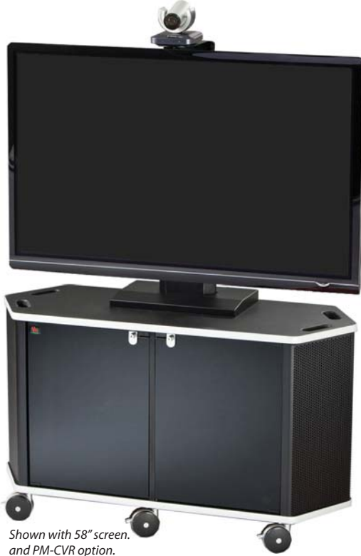
Shown with 58" screen and PM-CVR option.