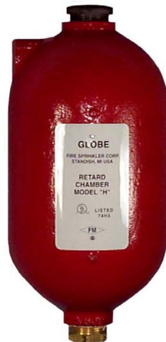
MODEL H RETARDCHAMBER

All interior operating parts are machined from highly corrosive-resistant alloys, each having high strength and good wear resistance.