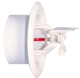
MODELS GL4230 & GL5630 RESIDENTIAL HORIZONTAL SIDEWALL

The heart of Globe's GL Series sprinkler proven actuating assembly is a hermetically sealed frangible glass ampule that contains a precisely measured amount of fluid. When heat is absorbed, the liquid within the bulb expands increasing the internal pressure. At the prescribed temperature the internal pressure within the ampule exceeds the strength of the glass causing the glass to shatter. This results in water discharge which is distributed in an approved pattern depending upon the deflector style used.