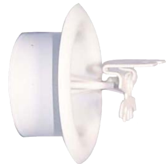
MODEL GL5631 RESIDENTIAL HORIZONTAL SIDEWALL