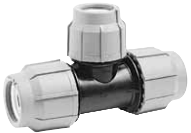
EQUAL TEE DIMENSIONS