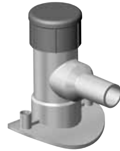
EF HVTT DIMENSIONS w/1 1/4" BUTT OUTLET