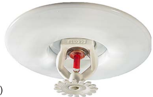
EXTENDED COVERAGE PENDENT WITH OPTIONAL 4 1/2" SEISMIC RECESSED ESCUTCHEON