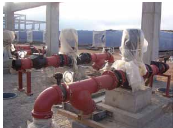
Model 726 Y-strainers, SJ-300N butterfly valves and SJ-900 check valves used on a chill water system.