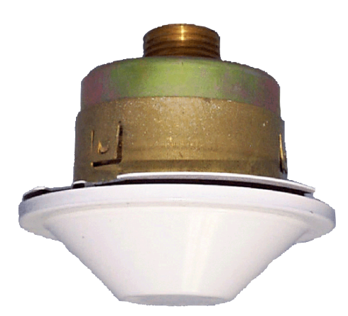
RESIDENTIAL CONCEALED PENDENT