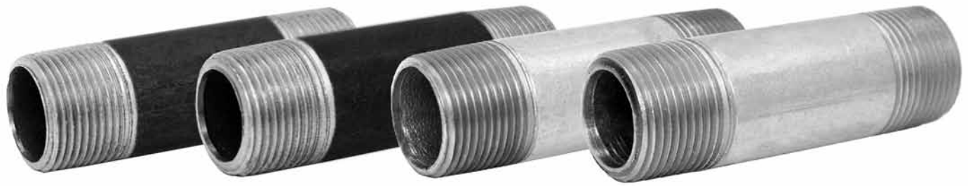
FIG. 339: Standard Black Schedule 40

Black & Galvanized, Std. Sch. 40, XH Sch. 80