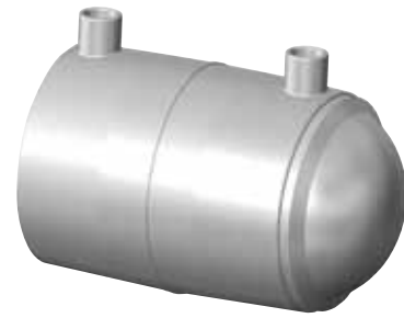
EF END CAP DIMENSIONS