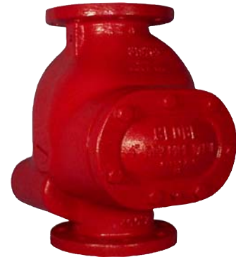
MODEL F-3 DRY PIPE VALVE