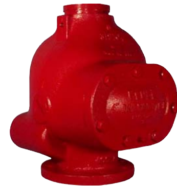
MODEL G-3 DRY PIPE VALVE