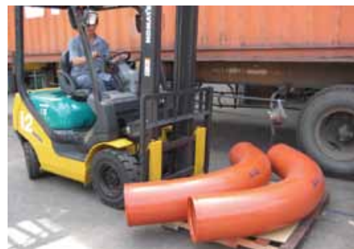
12" 3D 90° elbows ready for shipment