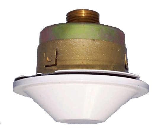
WHITE CONCEALED PENDENT