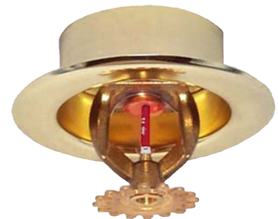
QUICK RESPONSE RECESSED EXTENDED COVERAGE PENDENT