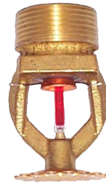
QUICK RESPONSE EXTENDED COVERAGE PENDENT