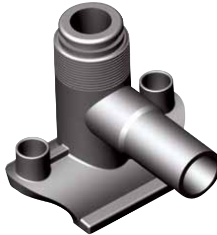
(PE2406/PE2708) ELECTROFUSION TAP TEE TRAINER w/Butt Outlet