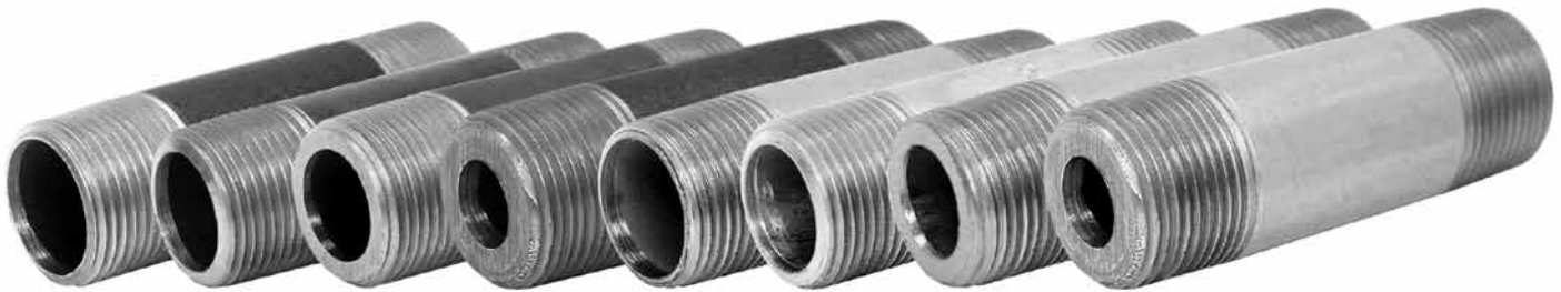
FIG. 320: Standard Black Sch. 40 FIG. 325: Extra Heavy Black Sch. 80 FIG. 326: 160 Black Sch. 160 FIG. 327: XXH Black FIG. 330: Standard Galv. Sch. 40 FIG. 335: Extra Heavy Galv. Sch. 80 FIG. 333: 160 Galv. Sch. 160 FIG. 329: XXH Galvanized