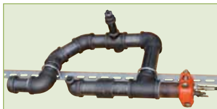
Burst pressure testing of DI threaded fittings (2")

Ductile Iron Class 300 threaded fittings are designed to the same dimensions as that of Class 150 malleable iron fittings. Though due to the superior strength characteristics, ductile iron fittings carry a much higher pressure rating. Laboratory tests confirm Shurjoint ductile iron fittings have passed hydrostatic test pressures exceeding 6,000 psi / 414 Bar, which is equal to four times the 1,500 psi / 103 Bar as specified by ANSI B16.3 for 1-1/2" – 2" sizes.