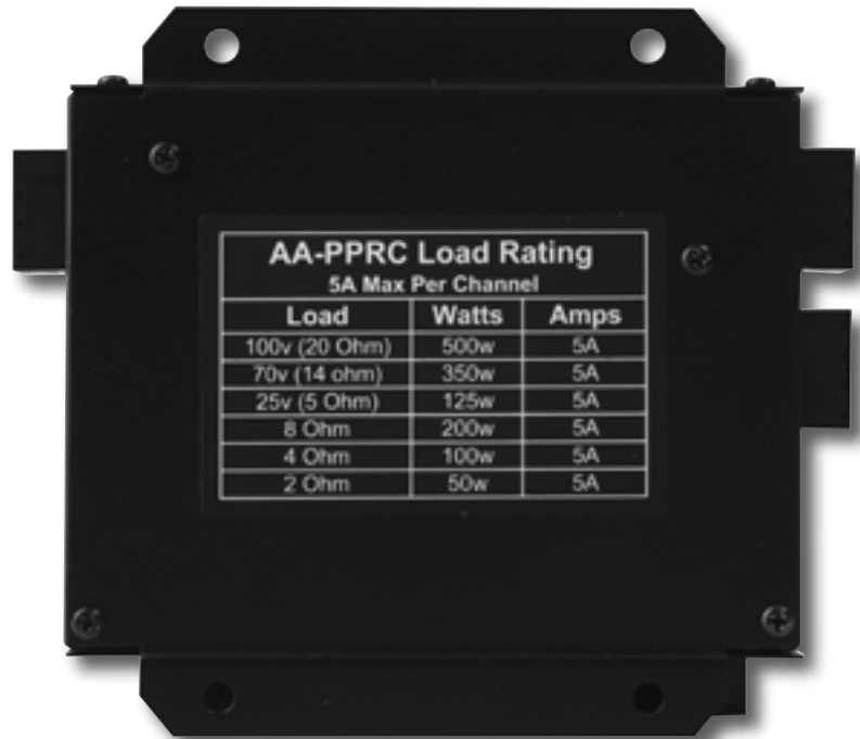
AA-PPRC – Back View