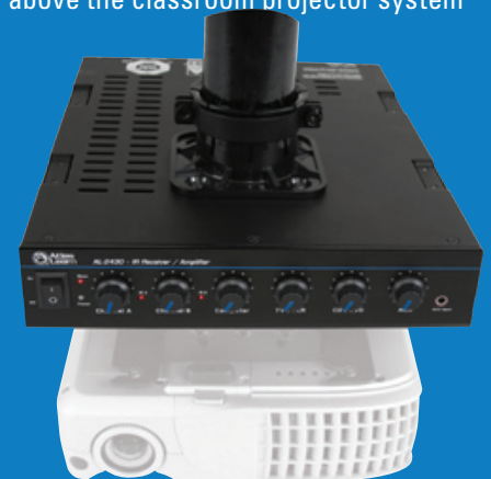
Projector Not Included

Atlas Sound’s patent pending pole mount design allows unit to be mounted above the classroom projector system