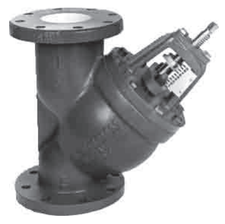
Models 721, 722