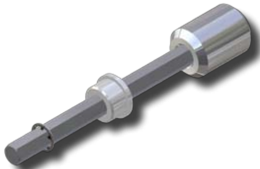
23-3691-00 ~ Drive Key Assembly for 1/2" Body Punch Tees 23-3692-00 ~ Drive Key Assembly for 3/4" Body Punch Tees