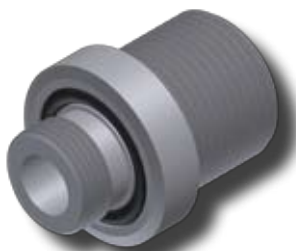
23-1644-00 ~ Test Plug Adapter for 1201 Style 1/2" Body Punch Tees 23-1645-00 ~ Test Plug Adapter for 1302 Style 3/4" Body Punch Tees