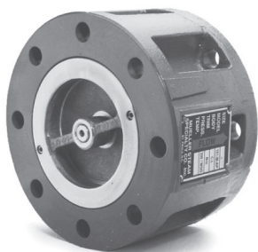
Model 101MAP, 103MAP