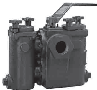
Models 792SH, 794SH

Strainers provide economical protection for costly pumps, meters, valves, and other similar mechanical equipment by straining foreign matter from the connected piping system. Installation of a strainer before mechanical equipment can ensure trouble free service and avoid costly shutdowns for repair or replacement of equipment damaged by foreign matter. The size of the perforation or mesh in the basket screen will determine the smallest particles captured. See pages Strainer Information section of the Mueller Steam Specialty Engineering binder for detailed information including sizes and materials available.