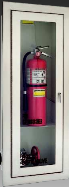
8065-A-HB-BH Full Glass Door

Fire valve cabinets that fit anywhere —Like their fire extinguisher cabinet counterpart, Alta Series fire valve cabinets offer an impressive variety of door styles, glazing materials, lettering choices, finishes and mounting configurations. While versatile, they also feature durable, unitized construction for an economical solution that complements virtually any type of construction.