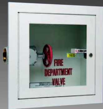
8020-B-RH Break Glass Panel with Break Rite® Handle