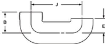
875-S DWV Trap Upturn M x S – Cast