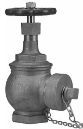
T-331-HC Threaded w/Cap and Chain