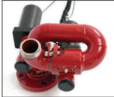
FP12300-12: MONITOR W/ 12 VDC MOTOR FP12300-24: MONITOR W/ 24 VDC MOTOR