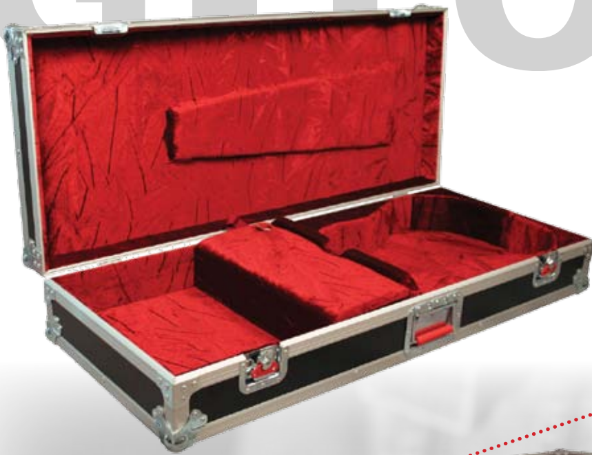
Protective Ball Corners