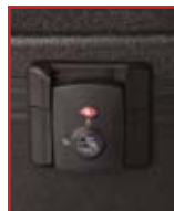
TSA Locking Latch

For detailed measurements see www.gatorcases.com