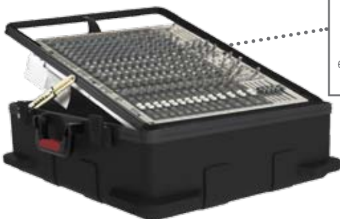
Patented pop-up ratchet system for transporting your mixer flat then elevating to various angles during use

Gator's Pop-Up Mixer Series uses the patented Pop-up ratchet system for transporting your mixer flat then elevating to various angles for a quick setup. The compact size allows for smaller transportation area requirements, but this case is big on features. The Pop-up mixers include a high density Polyethylene cabinet, TSA locking latches, threaded rack rails, black uninterrupted valance design, and comfort ergo-grip handles making this a perfect grab-n-go solution.