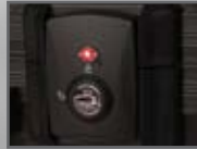
TSA Locking Latches