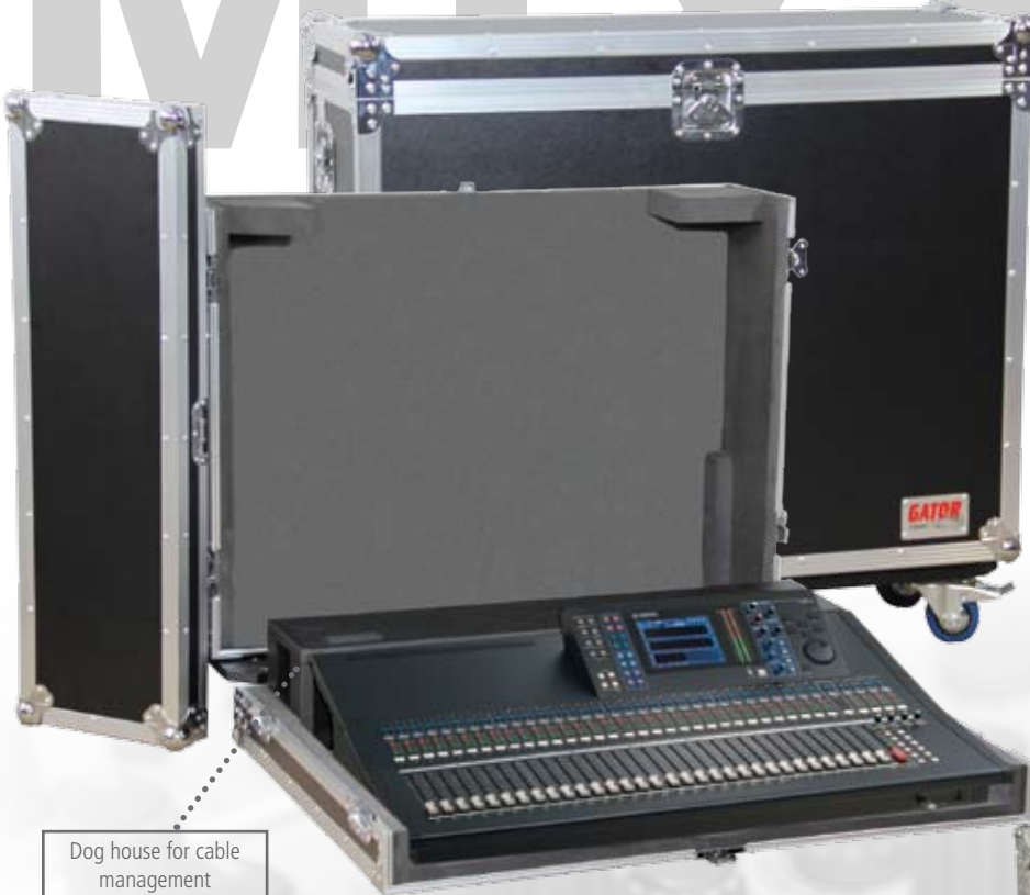
Dog house for cable management