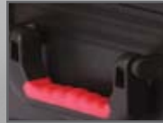
Comfort Grip Handle