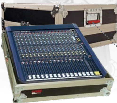
The fixed slant mixer case features a fixed angle 12U rack to set your mixer at a perfect angle for use while in the case