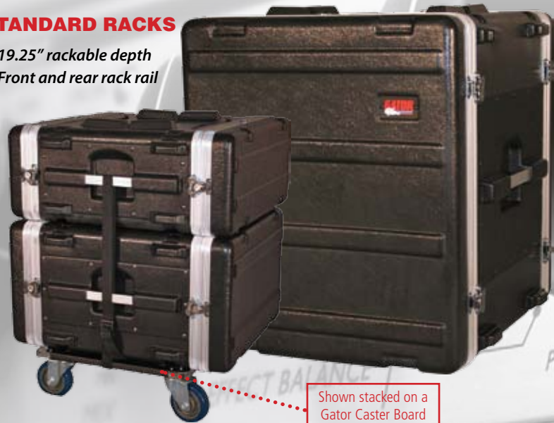
Shown stacked on a Gator Caster Board